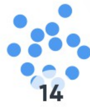
Alternate ways of doing things