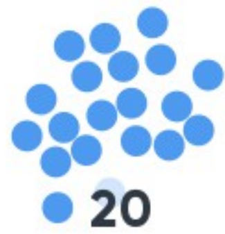
Residential coaching - Teachers and Students resides